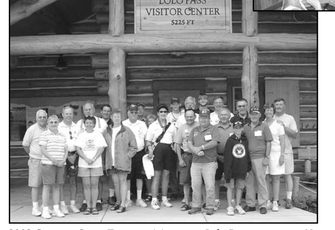
2003 Coast to Coast Tour participants at Lolo Pass enroute to New port. OR and final leg of the Plymouth 75th Anniversary Tour