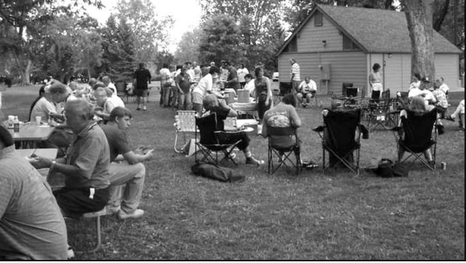
Hot Wheels Car Club hosted a picnic at Pioneer Park, Walla Walla, WA

He suggested his car club show the tour participants some Walla Walla hospitality! The timing was perfect since tour participants coming from Missoula had spent one of their more difficult driving